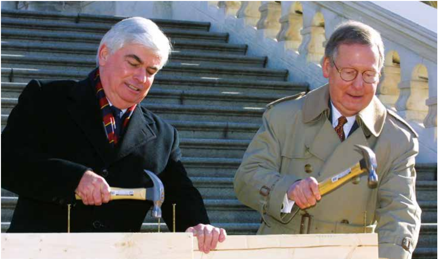
US Senators Chris Dodd, a Democrat, and Mitch McConnell, a Republican, take part in the First Nail Ceremony, December 6, 2000 in front of the Capitol. The event symbolizes the parties coming together, as they drive in the first nails to build a platform for the inauguration ceremony for a newly elected President. George W. Bush would take office the following January.