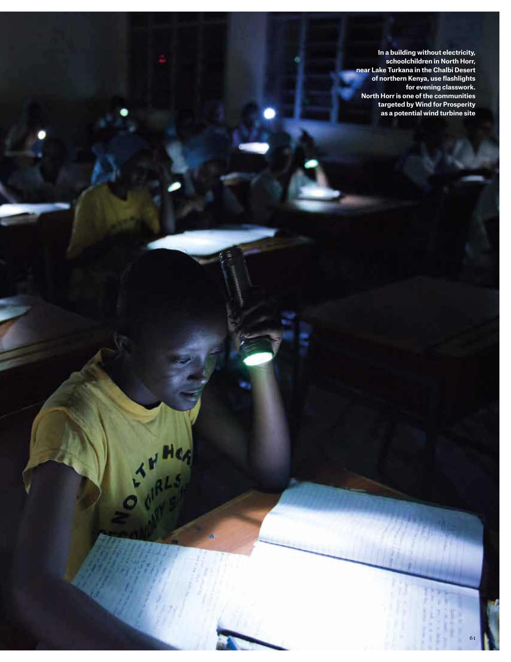
In a building without electricity, schoolchildren in North Horr, near Lake Turkana in the Chalbi Desert of northern Kenya, use flashlights for evening classwork. North Horr is one of the communities targeted by Wind for Prosperity as a potential wind turbine site